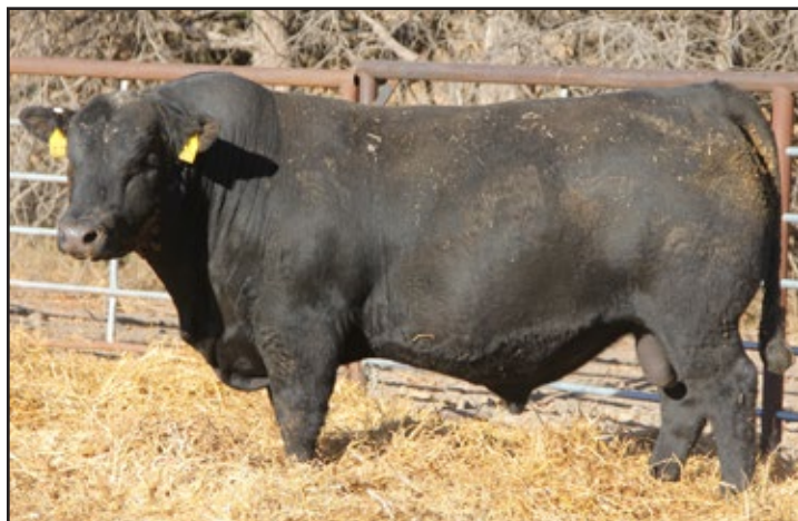
Lot 25 ■ KEY - Cool 272K