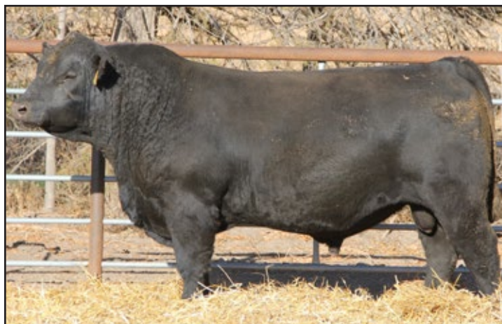
Lot 11 ■ KEY - Home Town 220K