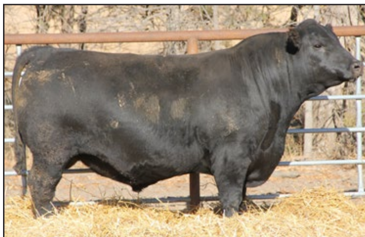
Lot 46 - KEY - Cool 2006K