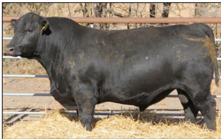
Lot 1 ■ KEY - Investment 274K