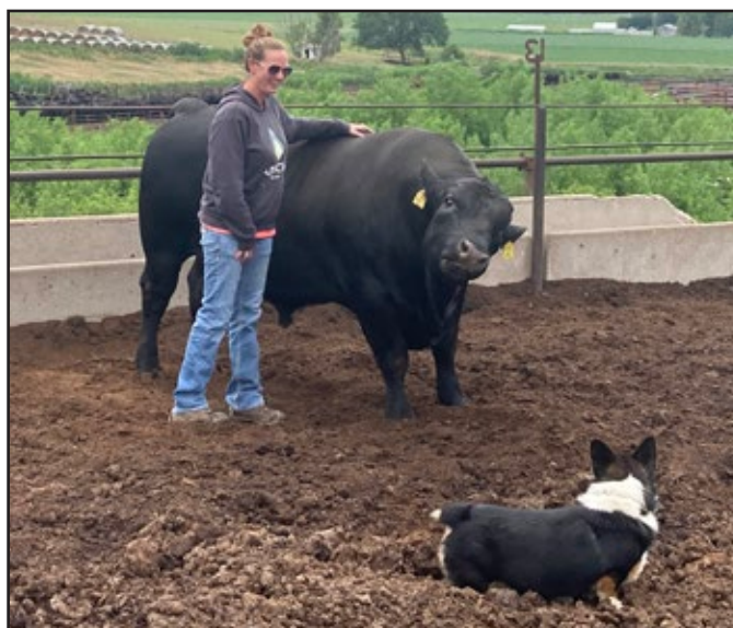
KEY - Phase One (#20201650) is super laid back and one of our exciting young sires.