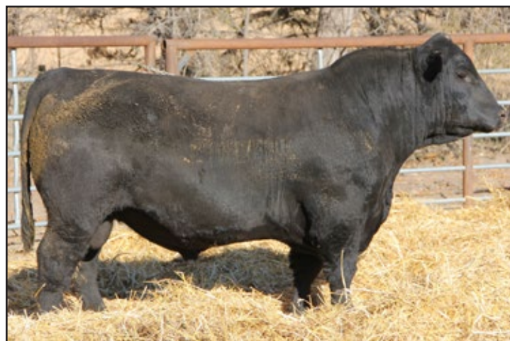
Lot 17 ■ KEY - Investment 279K