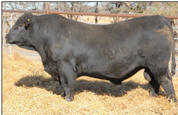
Lot 5 ■ KEY - Patriarch 2007K