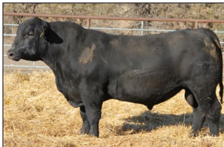
Lot 60 ■ KEY - Scale House 273K