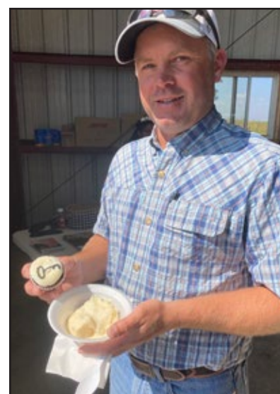
We enjoyed being one of the stops on the Nebraska Angus Tour this summer.