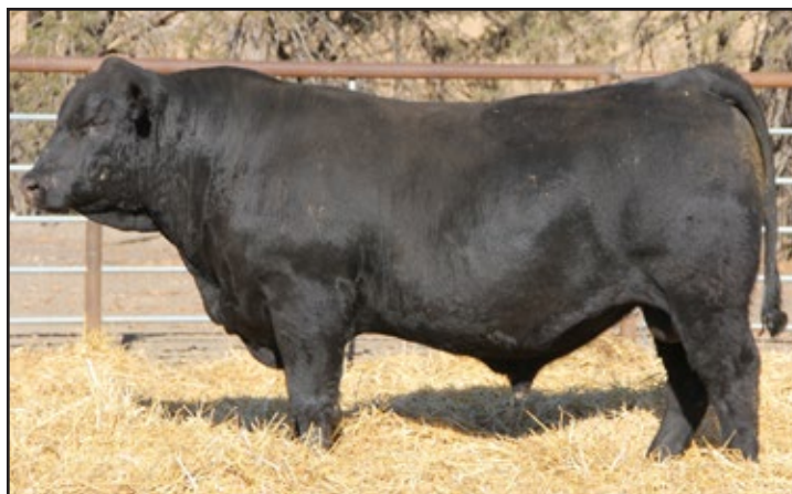
Lot 30 ■ KEY - Gold 2021K