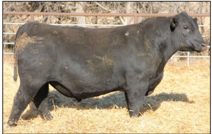
Lot 36 ■ KEY - Reliance 2008K