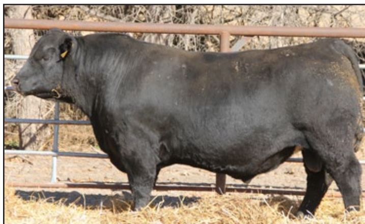
Lot 3 ■ KEY - Weigh 270K