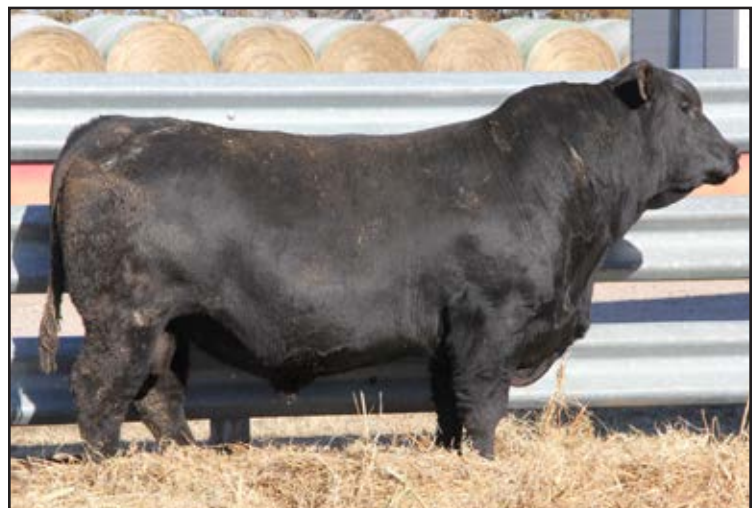
Lot 36 ■ KEY - Benchmark 310L