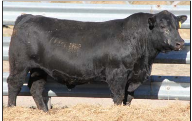
Lot 22 ■ KEY - Scale House 3030L