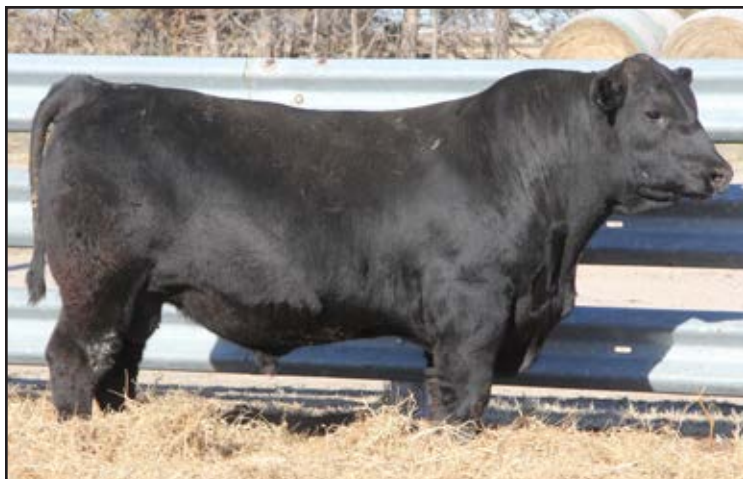
Lot 25 ■ KEY - Weigh 368L