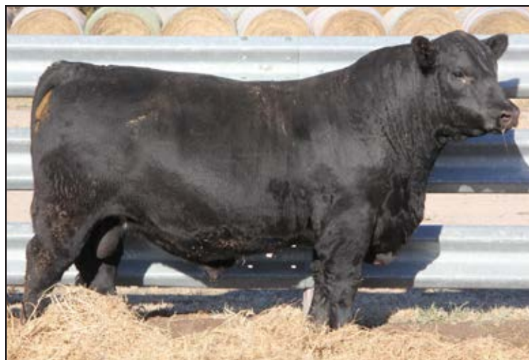
Lot 57 ■ KEY - Strut 326L