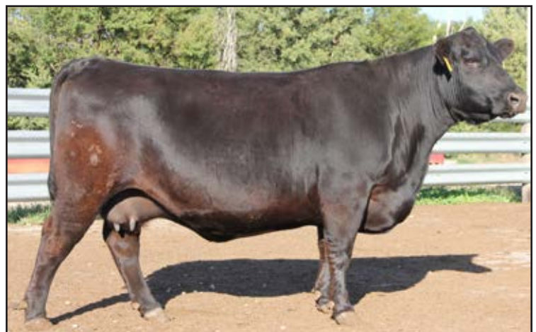
Brads Birdie Barton 4041 Dam of Lots 2-6, 10, 12, 13, 23