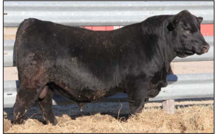
Lot 5 - KEY - Barricade 3115L