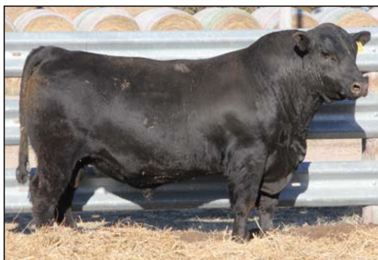
Lot 50 ■ KEY - Conclusion 376L