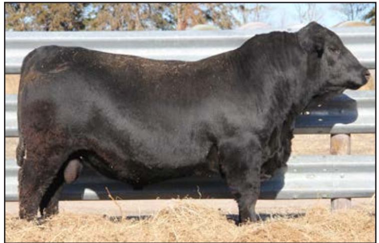
Lot 1 - KEY - Barricade 354L